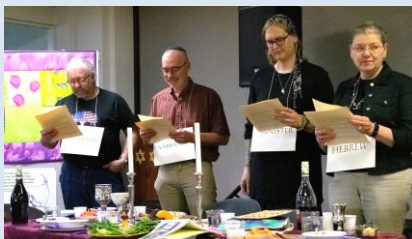
More photos from Passover 2019