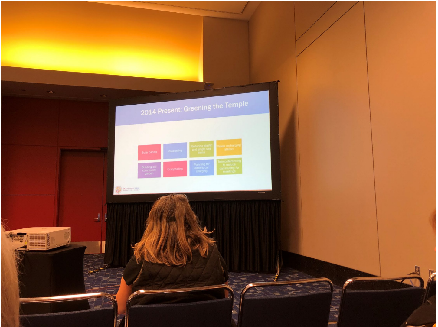
Photo caption contest! Email the Temple Office with your cleverest caption for this photo taken by Jon Leo at Biennial last month. The top three winners will each receive a prize. We're not sure what the prizes might be, but they'll be fabulous!

Contest deadline: Friday, January 31 . Winners will be announced in the February Bulletin!