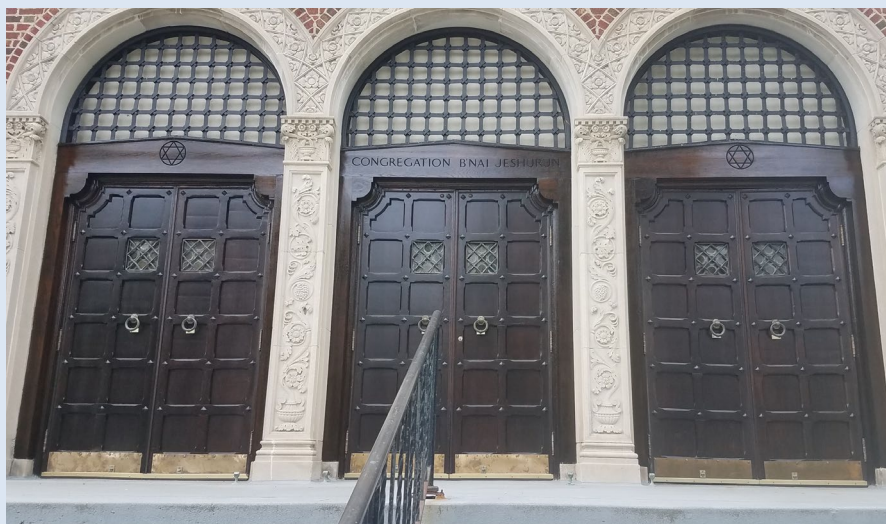
Here is the finished set of doors! Ready for another 96 years of Nebraska weather...

10:45 am – Torah Study on Parashat Korach